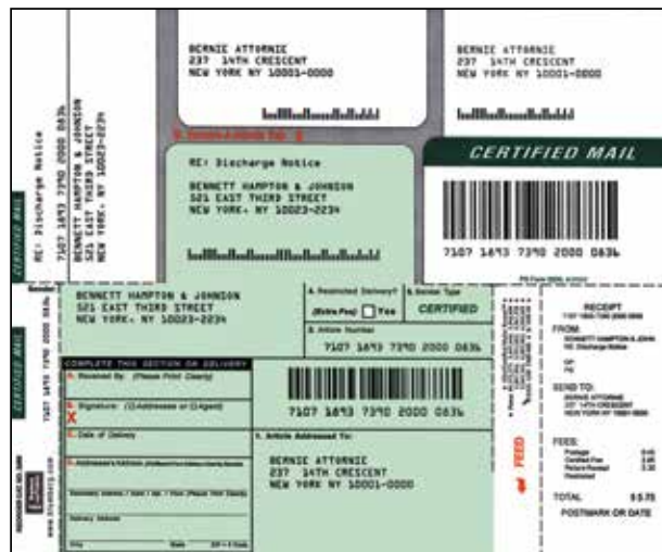
Certified Mail Label 3086. Actual Size 8½" x 7"

Download at blumberg.com/software . Requires certified mail labels. Email support only.